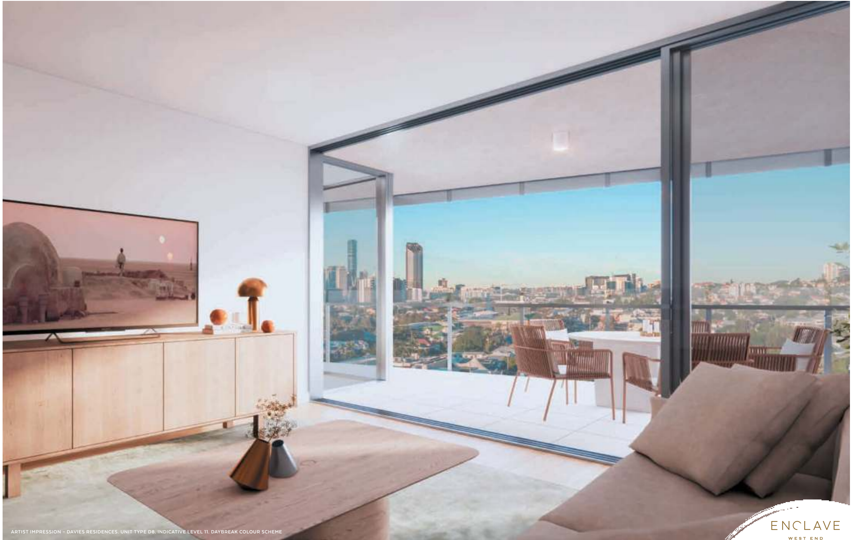
ARTIST IMPRESSION - DAVIES RESIDENCES, UNIT TYPE D8, INDICATIVE LEVEL 11, DAYBREAK COLOUR SCHEME