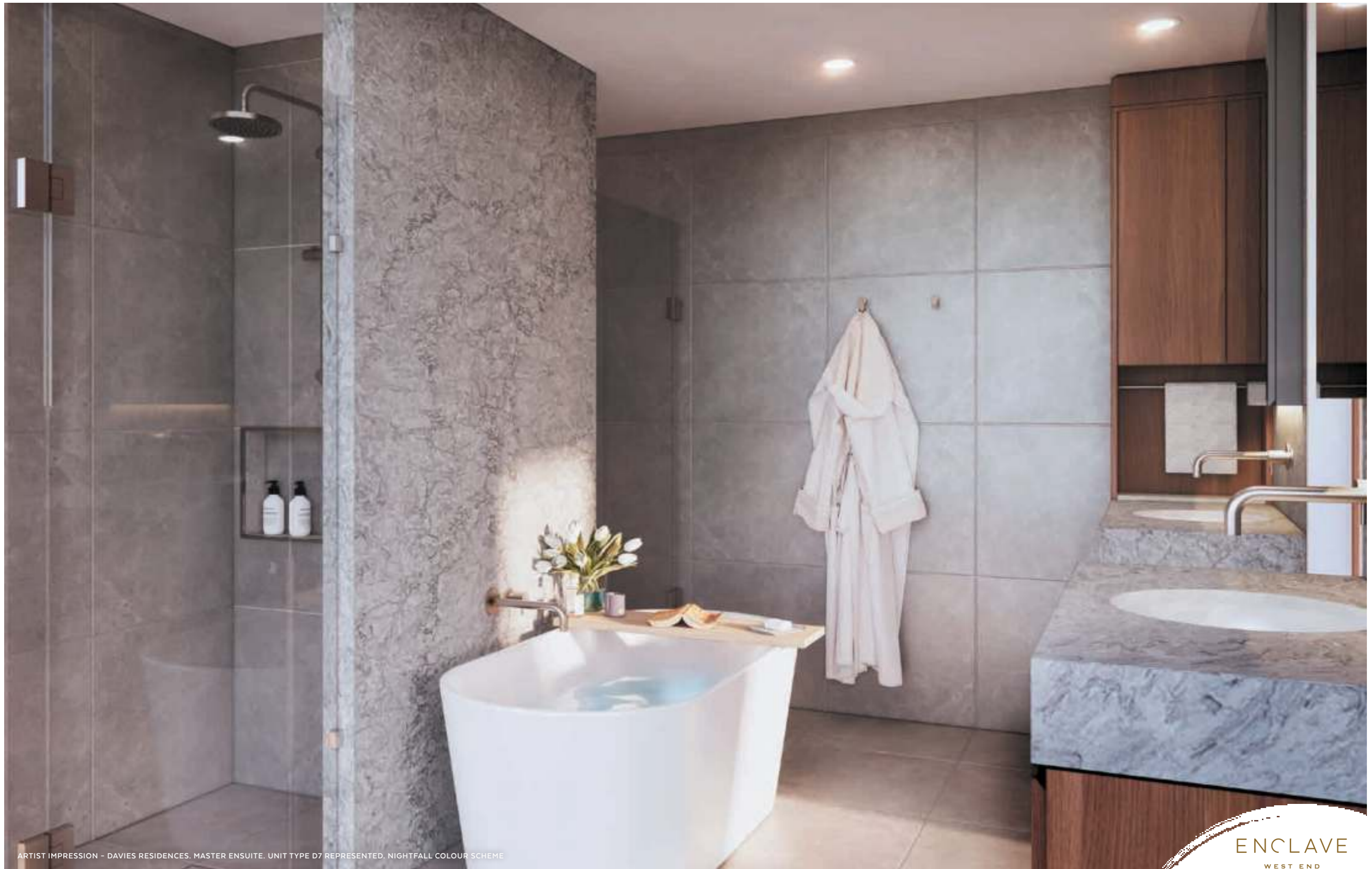
ARTIST IMPRESSION - DAVIES RESIDENCES, MASTER ENSUITE, UNIT TYPE D7 REPRESENTED, NIGHTFALL COLOUR SCHEME