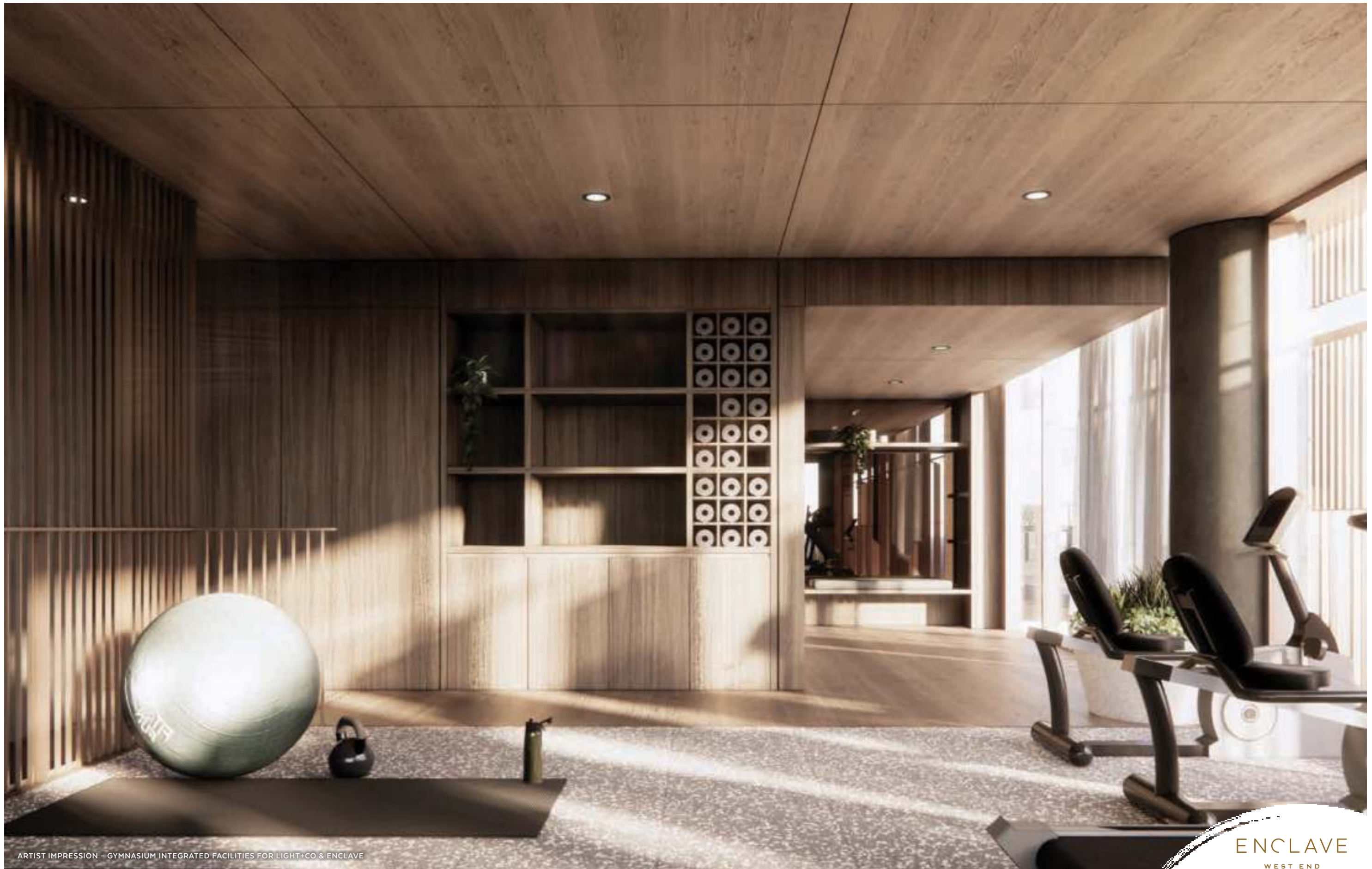
ARTIST IMPRESSION - GYMNASIUM INTEGRATED FACILITIES FOR LIGHT+CO & ENCLAVE