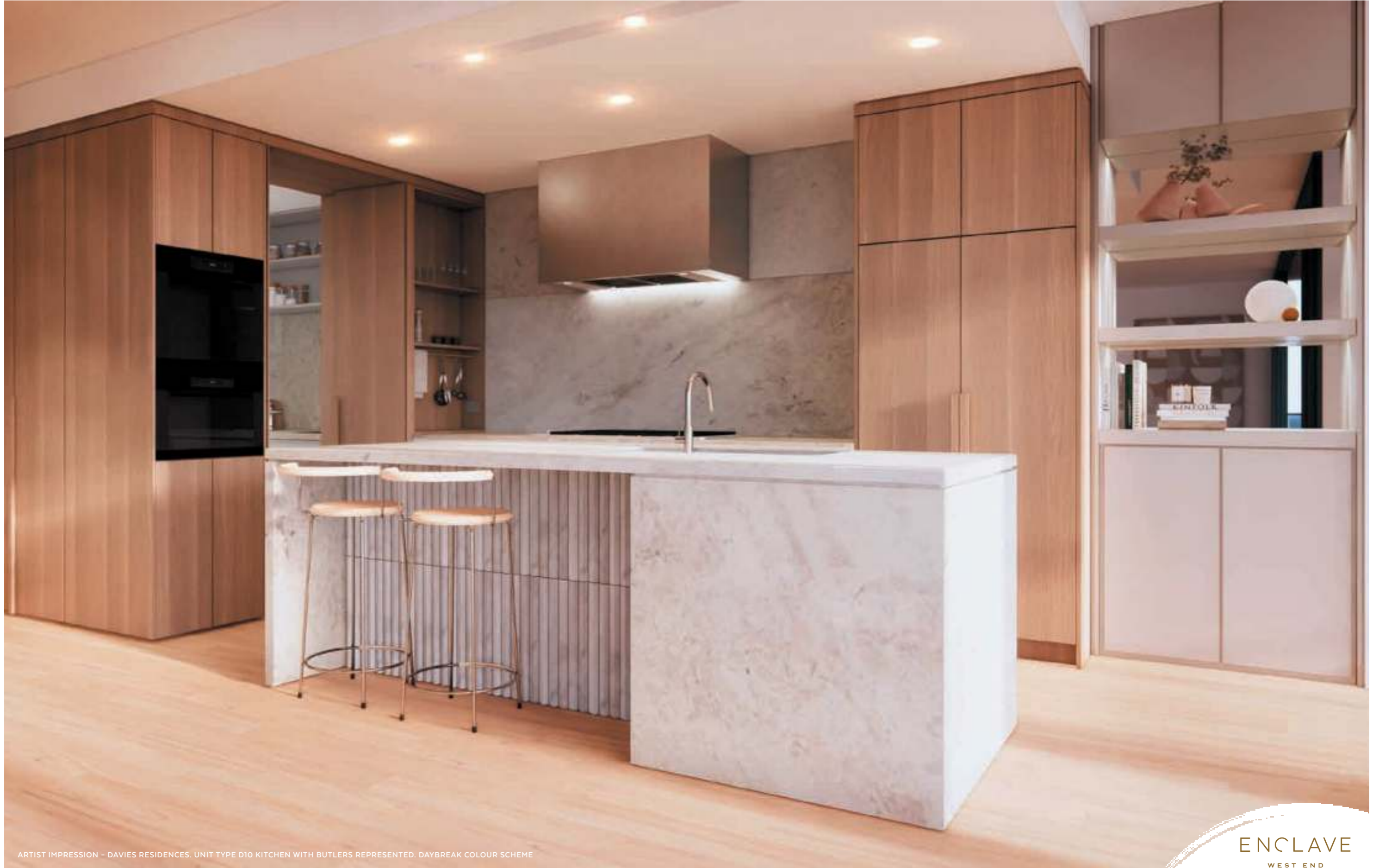
ARTIST IMPRESSION - DAVIES RESIDENCES. UNIT TYPE D10 KITCHEN WITH BUTLERS REPRESENTED. DAYBREAK COLOUR SCHEME