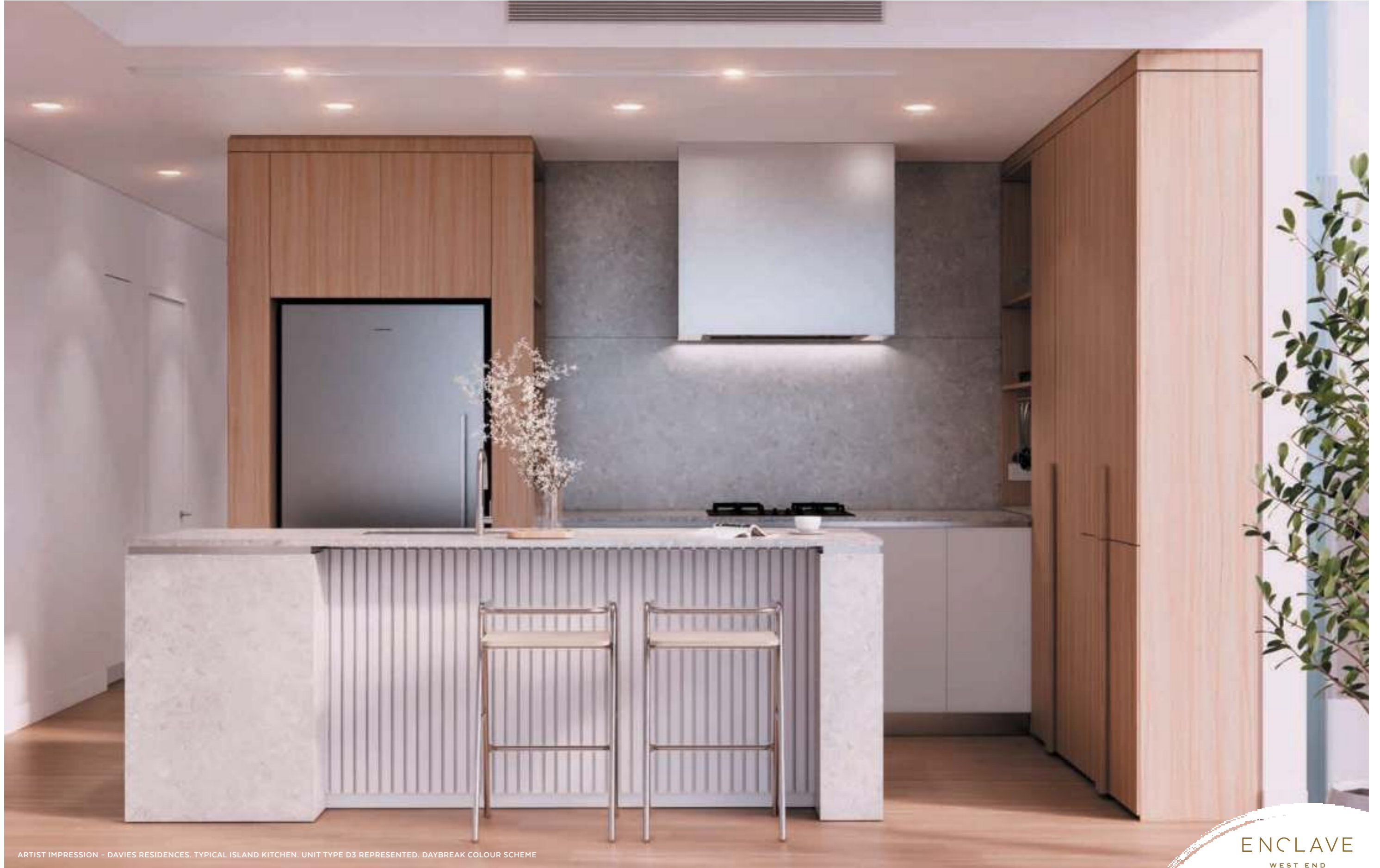
ARTIST IMPRESSION - DAVIES RESIDENCES. TYPICAL ISLAND KITCHEN. UNIT TYPE D3 REPRESENTED. DAYBREAK COLOUR SCHEME