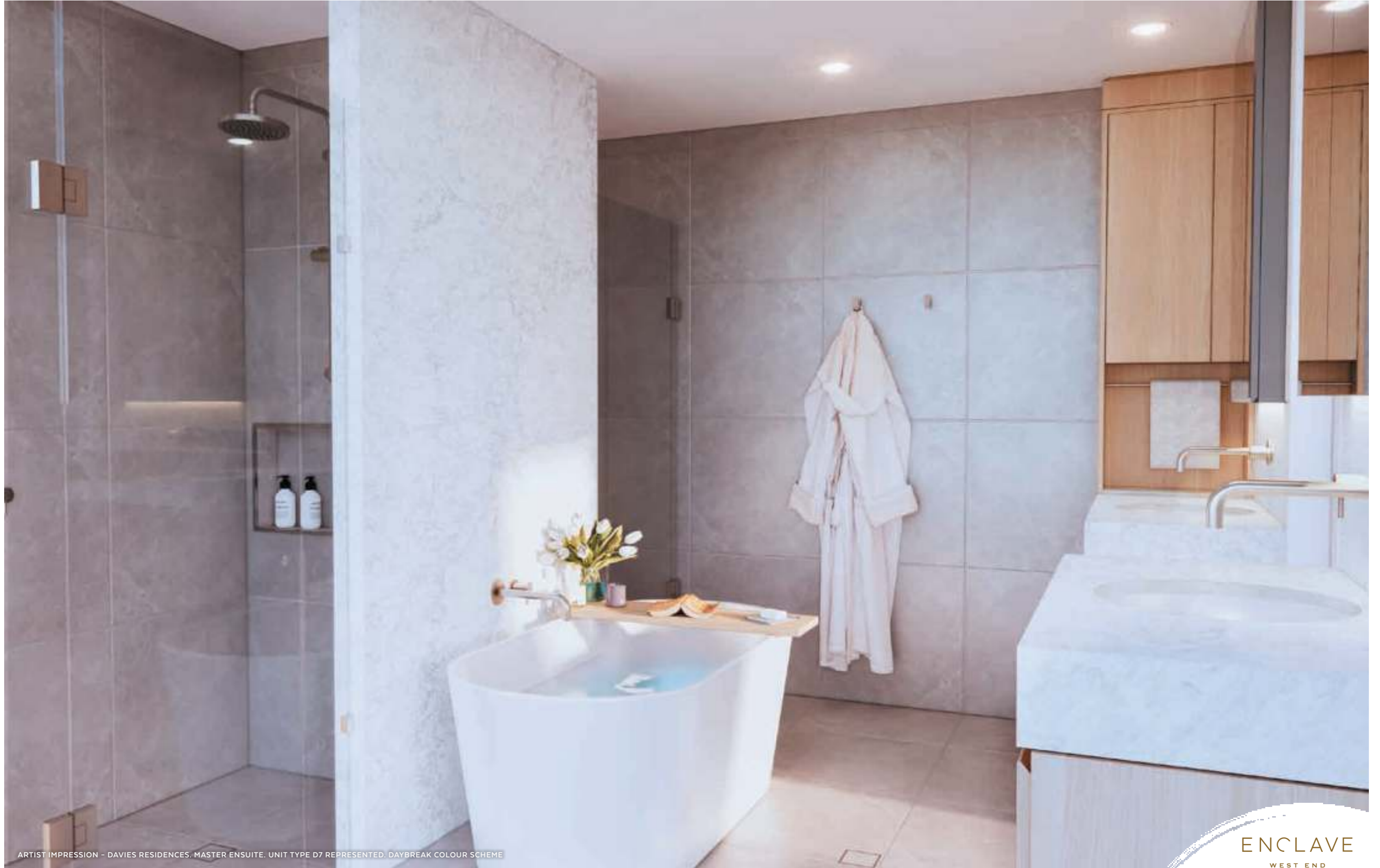
ARTIST IMPRESSION - DAVIES RESIDENCES, MASTER ENSUITE, UNIT TYPE D7 REPRESENTED, DAYBREAK COLOUR SCHEME