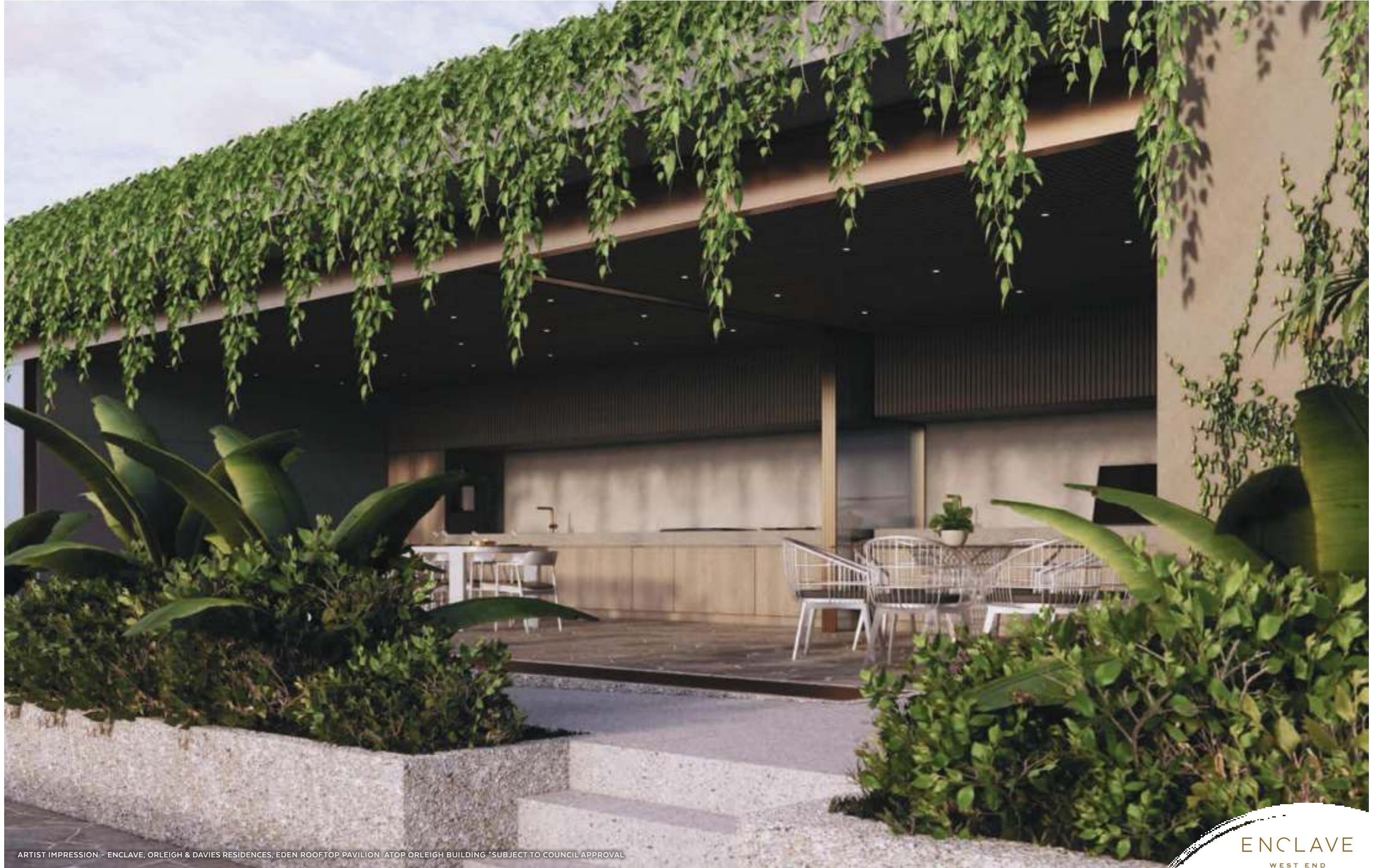
ARTIST IMPRESSION - ENCLAVE, ORLEIGH & DAVIES RESIDENCES, EDEN ROOFTOP PAVILION ATOP ORLEIGH BUILDING *SUBJECT TO COUNCIL APPROVAL