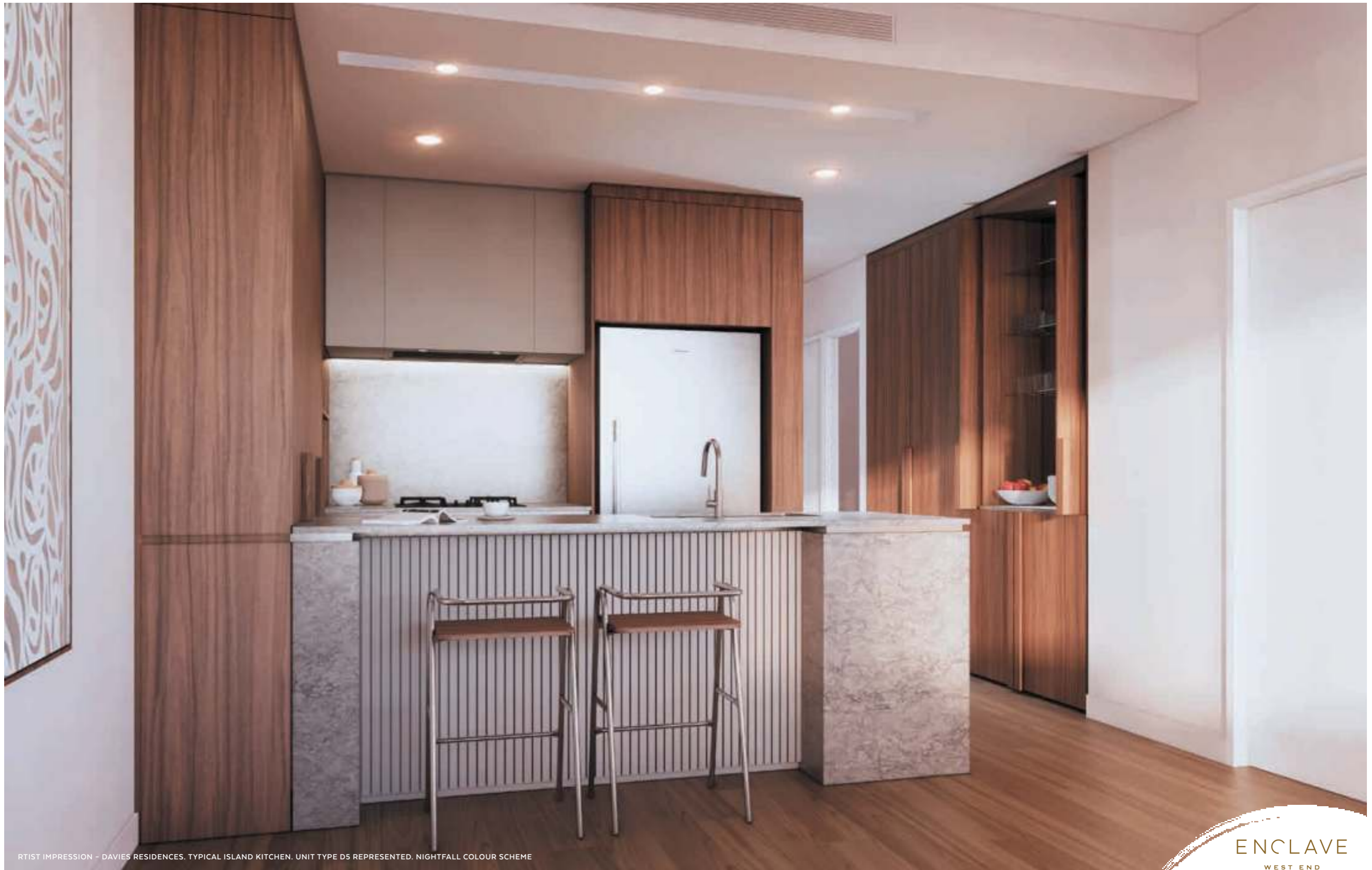
ARTIST IMPRESSION - DAVIES RESIDENCES, TYPICAL ISLAND KITCHEN, UNIT TYPE D5 REPRESENTED, NIGHTFALL COLOUR SCHEME