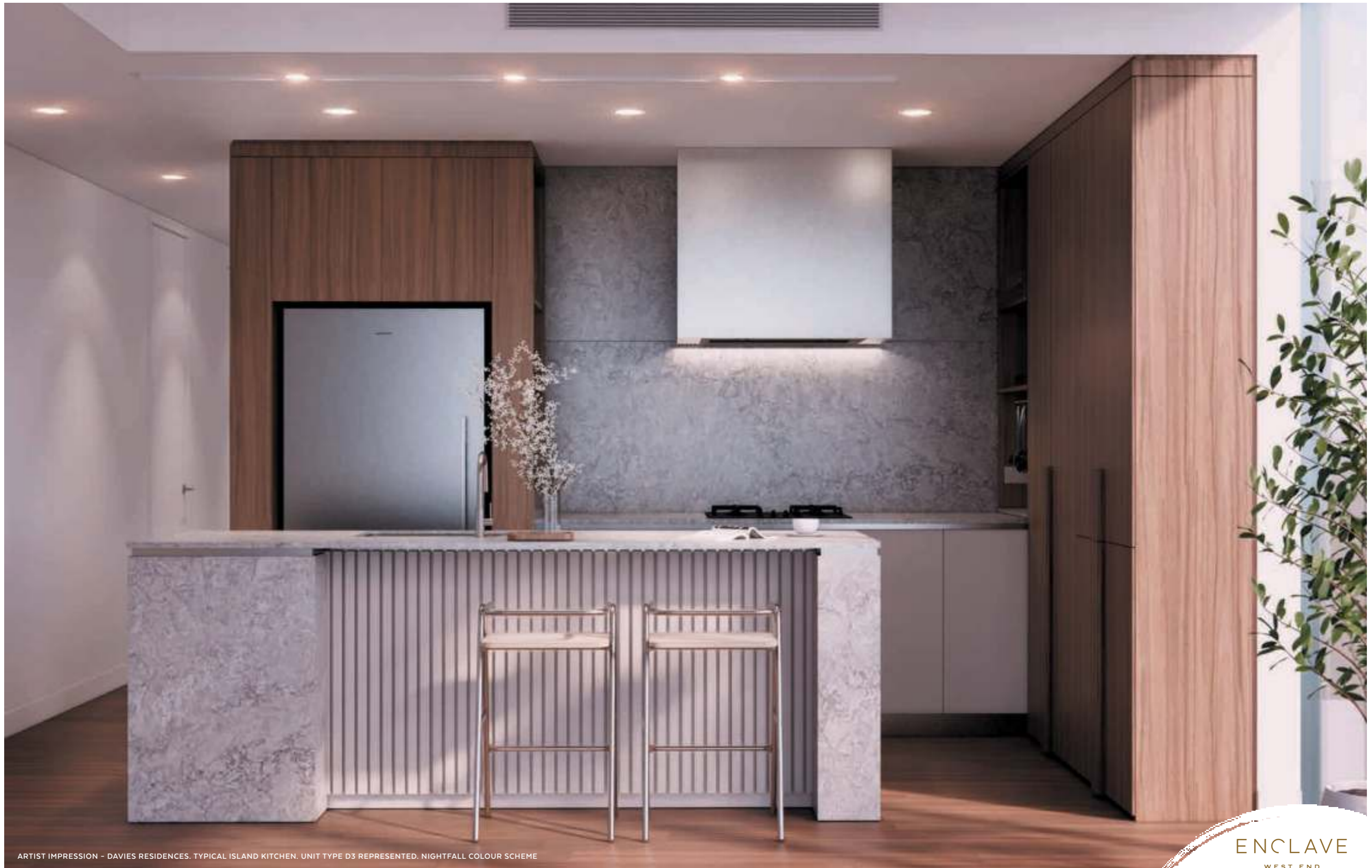
ARTIST IMPRESSION - DAVIES RESIDENCES. TYPICAL ISLAND KITCHEN. UNIT TYPE D3 REPRESENTED. NIGHTFALL COLOUR SCHEME