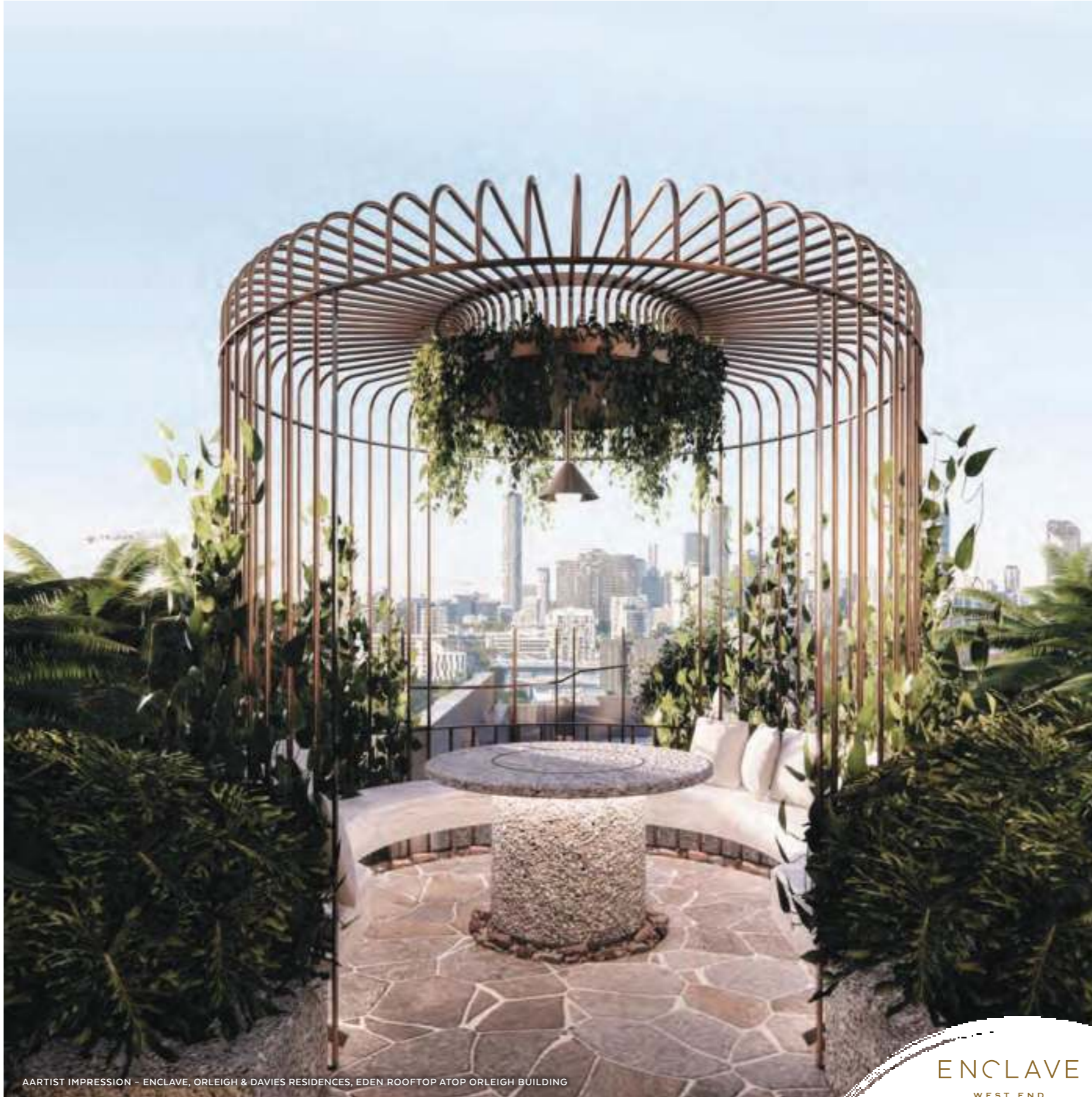
AARTIST IMPRESSION - ENCLAVE, ORLEIGH & DAVIES RESIDENCES, EDEN ROOFTOP ATOP ORLEIGH BUILDING