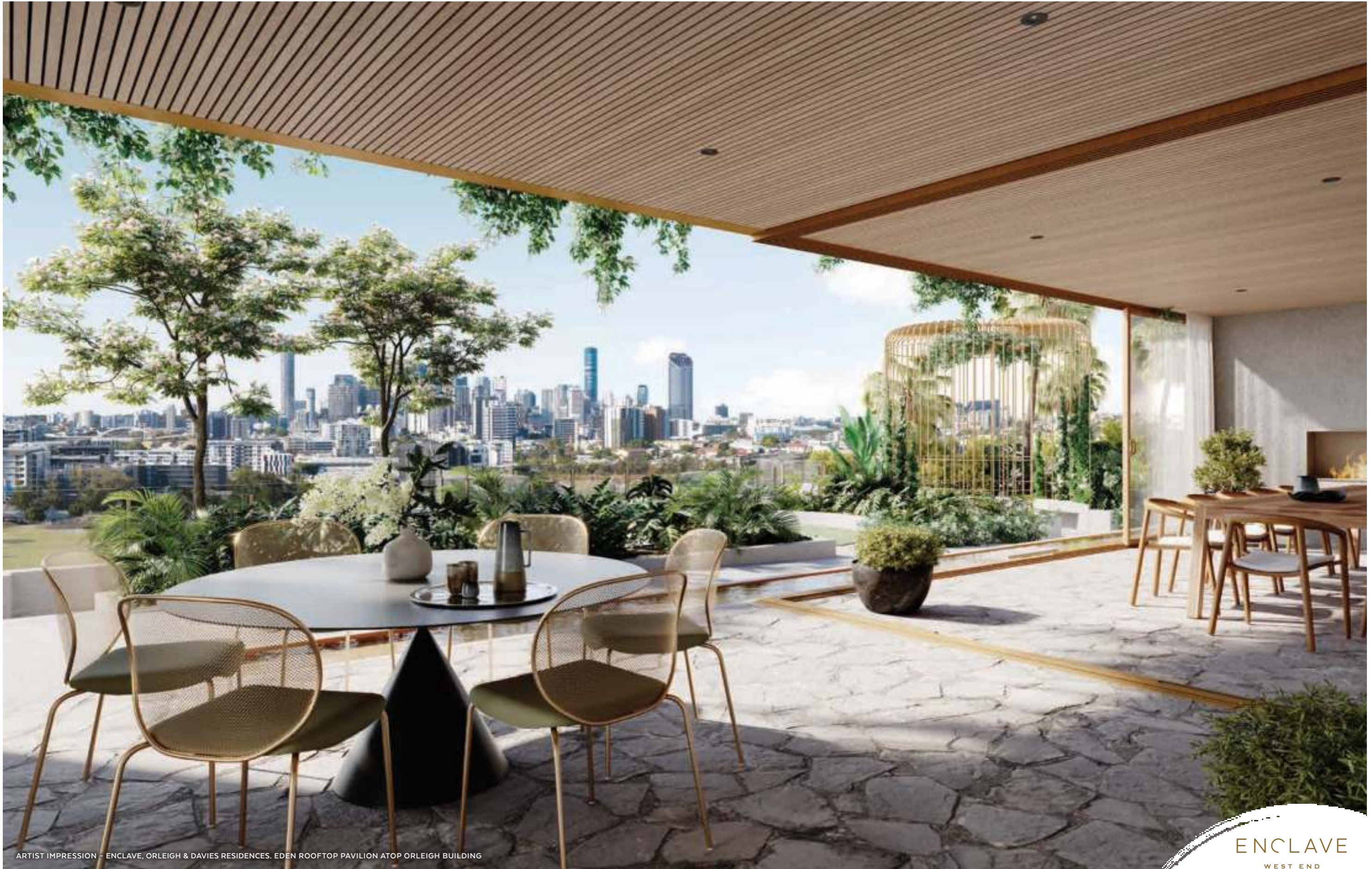
ARTIST IMPRESSION - ENCLAVE, ORLEIGH & DAVIES RESIDENCES. EDEN ROOFTOP PAVILION ATOP ORLEIGH BUILDING