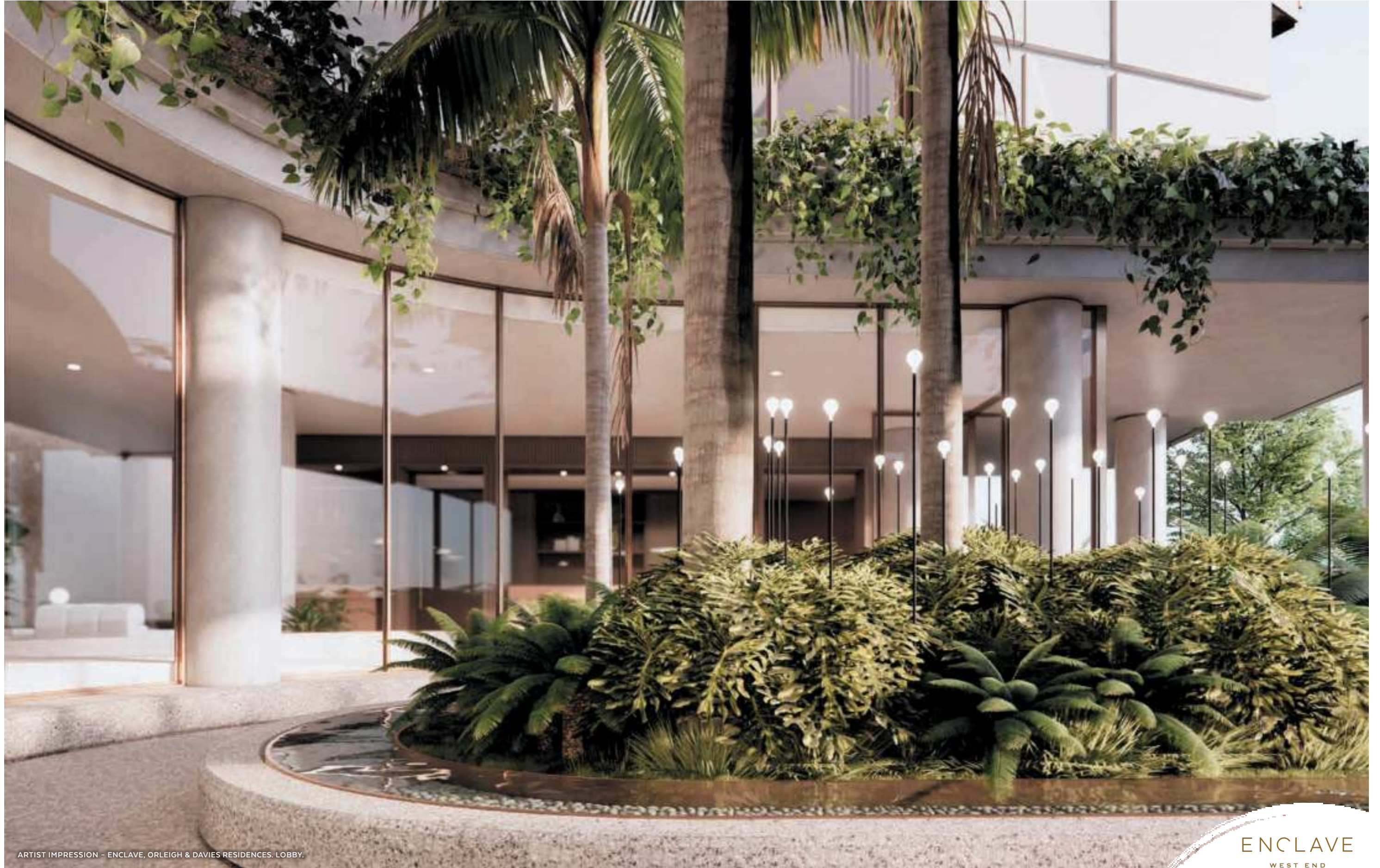
ARTIST IMPRESSION - ENCLAVE, ORLEIGH & DAVIES RESIDENCES, LOBBY.