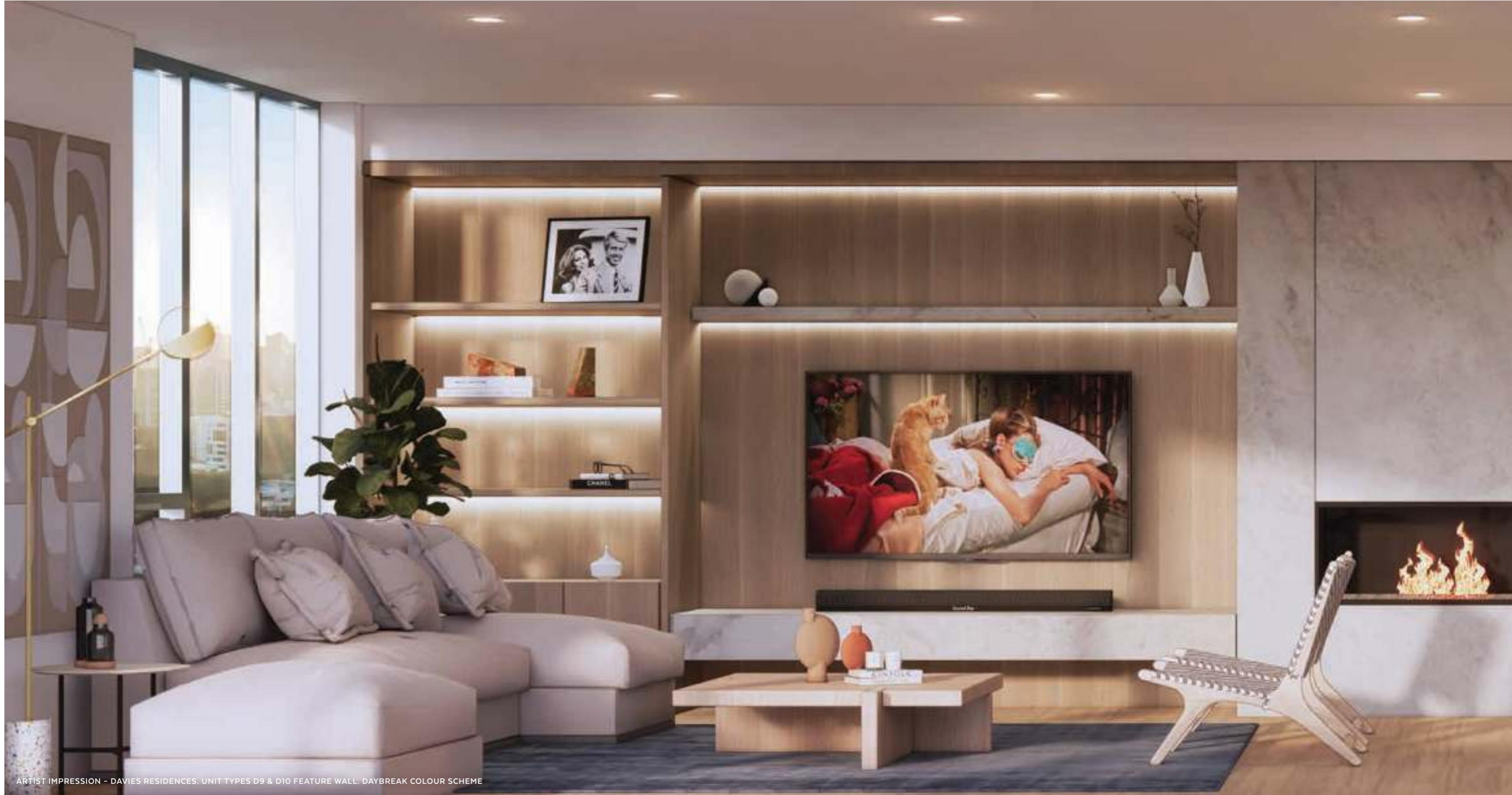
ARTIST IMPRESSION - DAVIES RESIDENCES. UNIT TYPES D9 & D10 FEATURE WALL. DAYBREAK COLOUR SCHEME