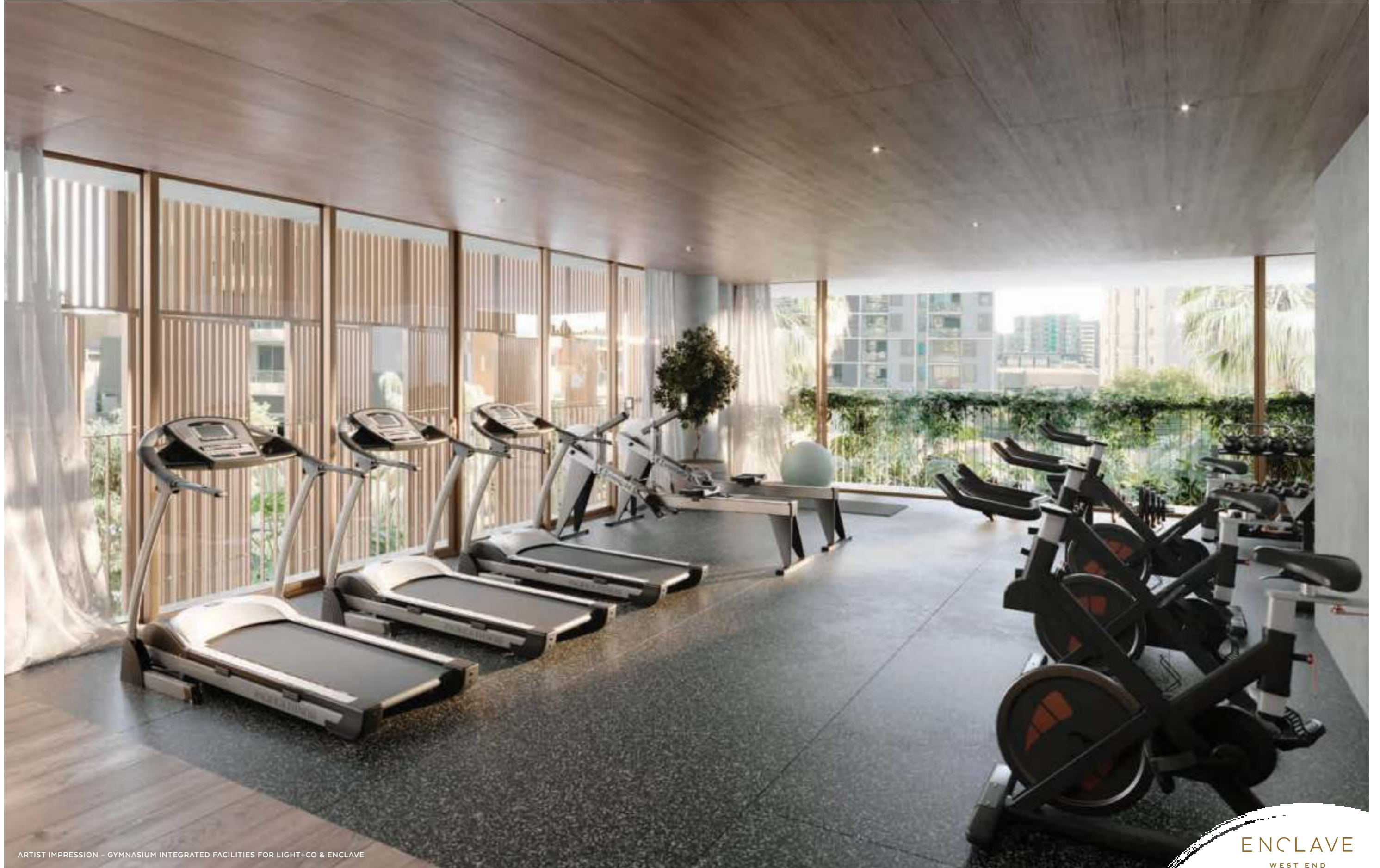
ARTIST IMPRESSION - GYMNASIUM INTEGRATED FACILITIES FOR LIGHT+CO & ENCLAVE