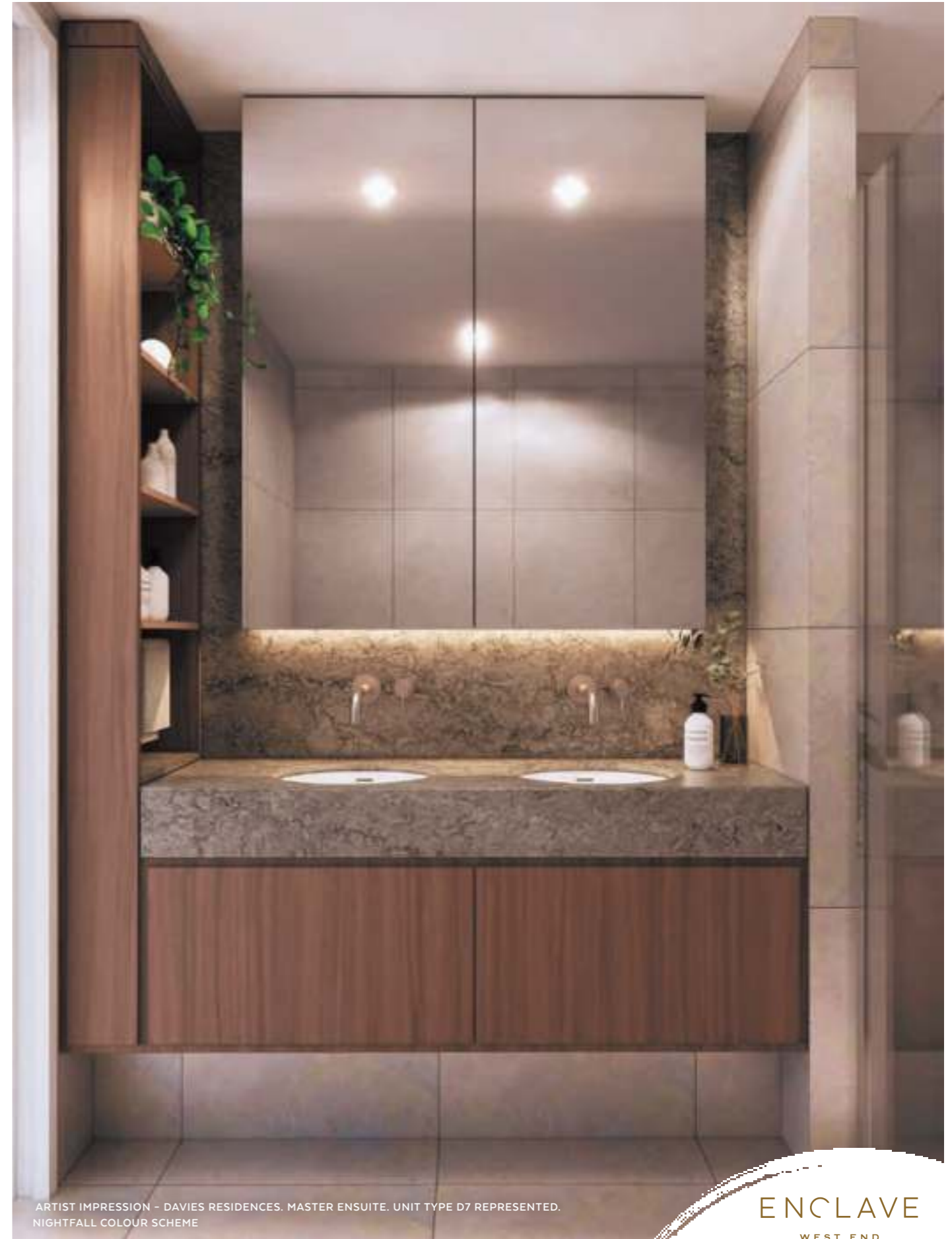
ARTIST IMPRESSION - DAVIES RESIDENCES. MASTER ENSUITE. UNIT TYPE D7 REPRESENTED. NIGHTFALL COLOUR SCHEME