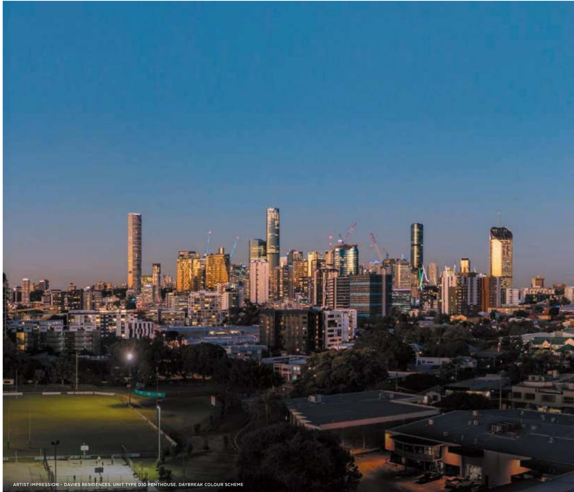
ARTIST IMPRESSION - DAVIES RESIDENCES. UNIT TYPE D10 PENTHOUSE. DAYBREAK COLOUR SCHEME