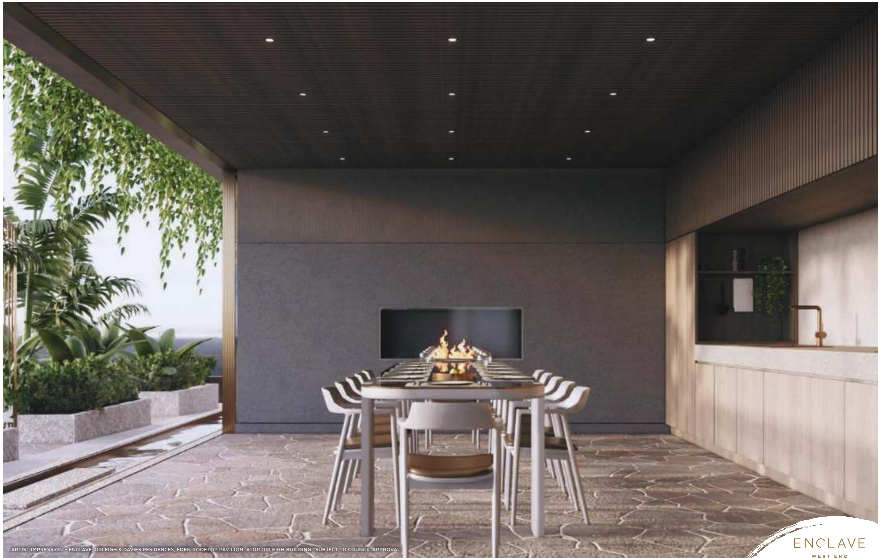
ARTIST IMPRESSION - ENCLAVE, ORLEIGH & DAVIES RESIDENCES, EDEN ROOFTOP PAVILION ATOP ORLEIGH BUILDING *SUBJECT TO COUNCIL APPROVAL