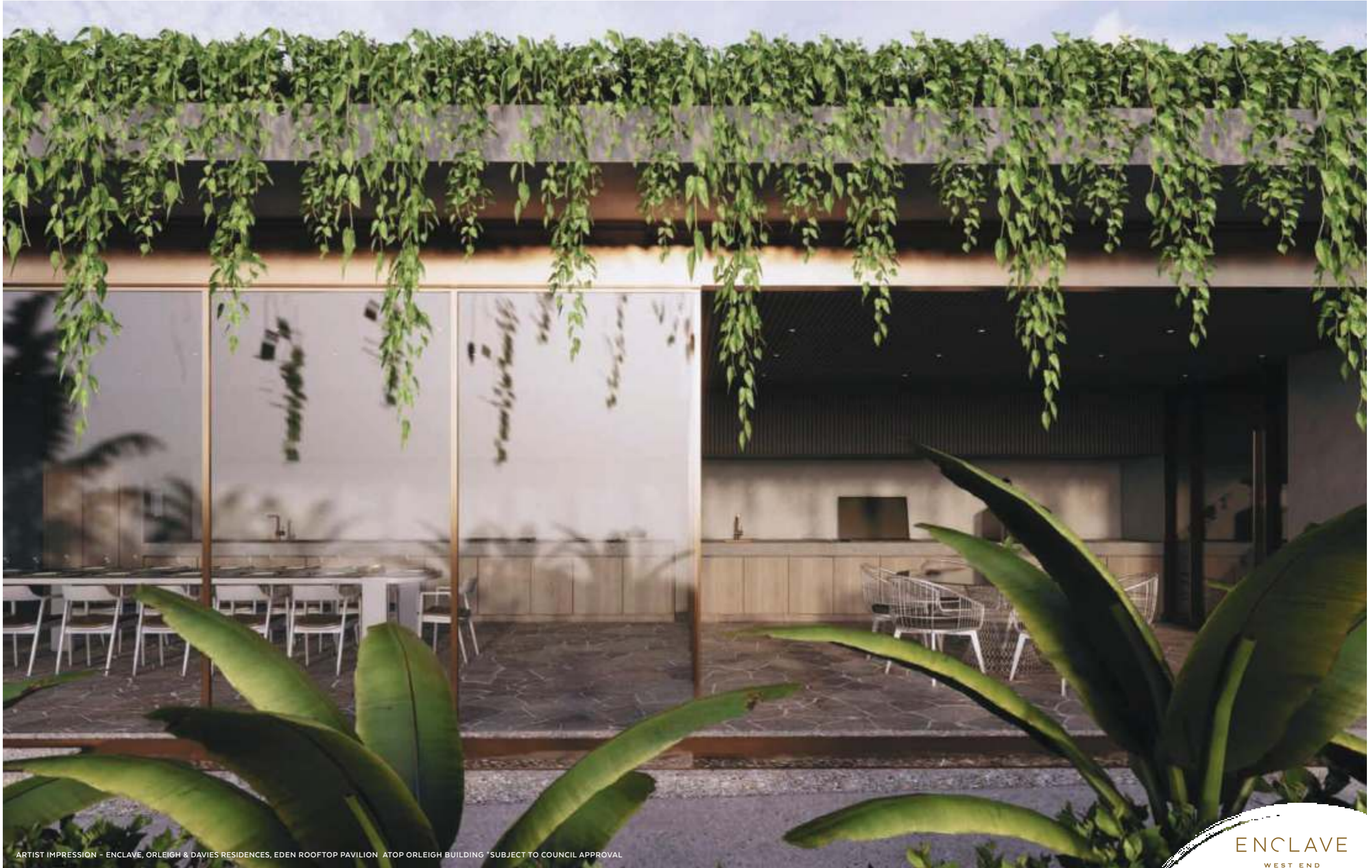
ARTIST IMPRESSION - ENCLAVE, ORLEIGH & DAVIES RESIDENCES, EDEN ROOFTOP PAVILION ATOP ORLEIGH BUILDING *SUBJECT TO COUNCIL APPROVAL