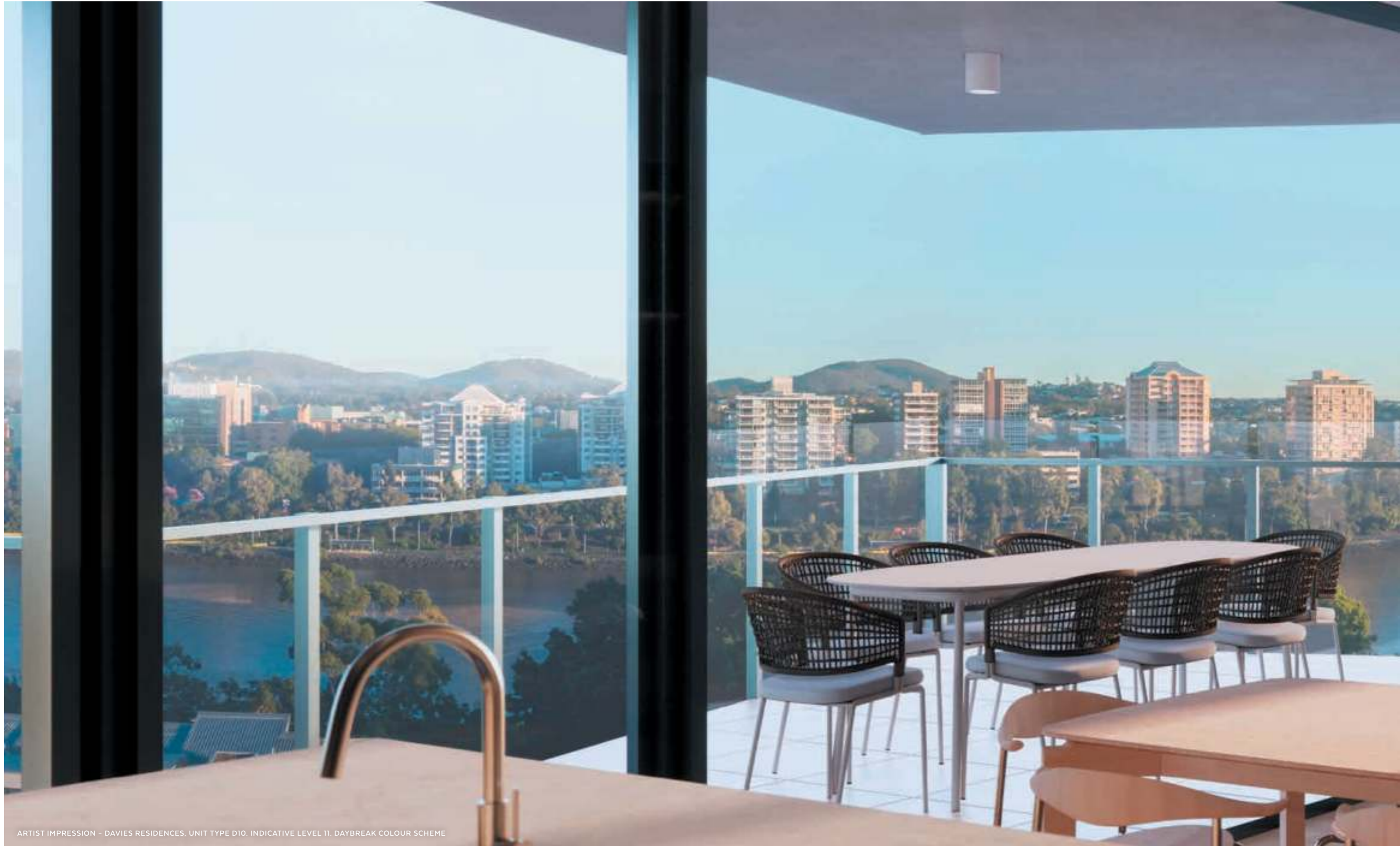
ARTIST IMPRESSION - DAVIES RESIDENCES. UNIT TYPE D10. INDICATIVE LEVEL 11. DAYBREAK COLOUR SCHEME