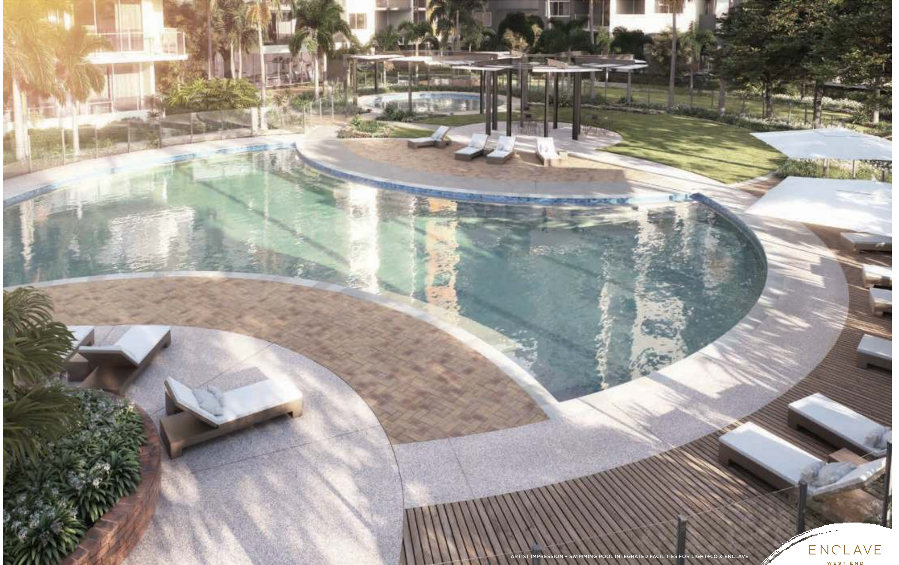
ARTIST IMPRESSION - SWIMMING POOL INTEGRATED FACILITIES FOR LIGHT+CO & ENCLAVE