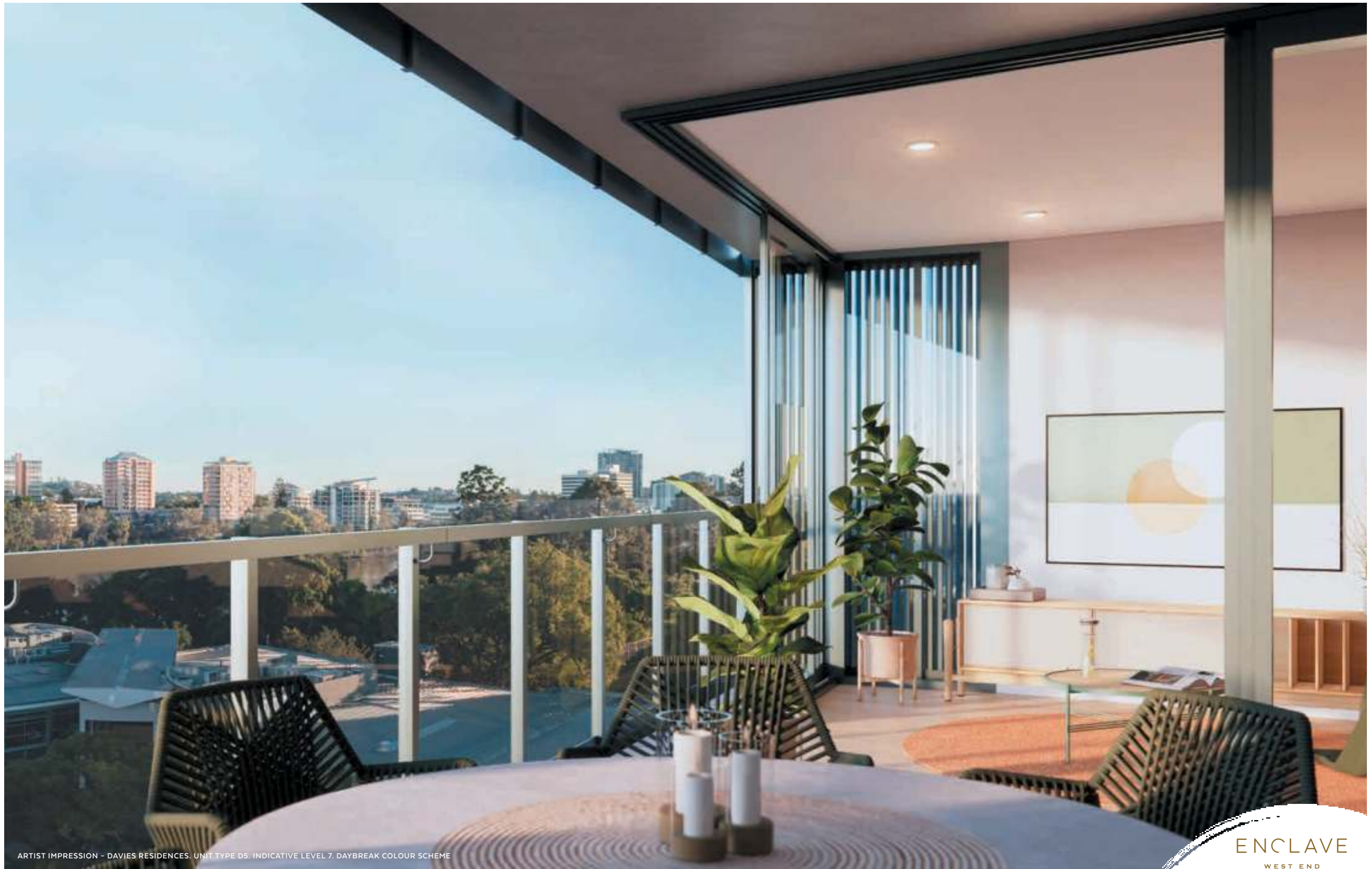
ARTIST IMPRESSION - DAVIES RESIDENCES. UNIT TYPE D5. INDICATIVE LEVEL 7. DAYBREAK COLOUR SCHEME