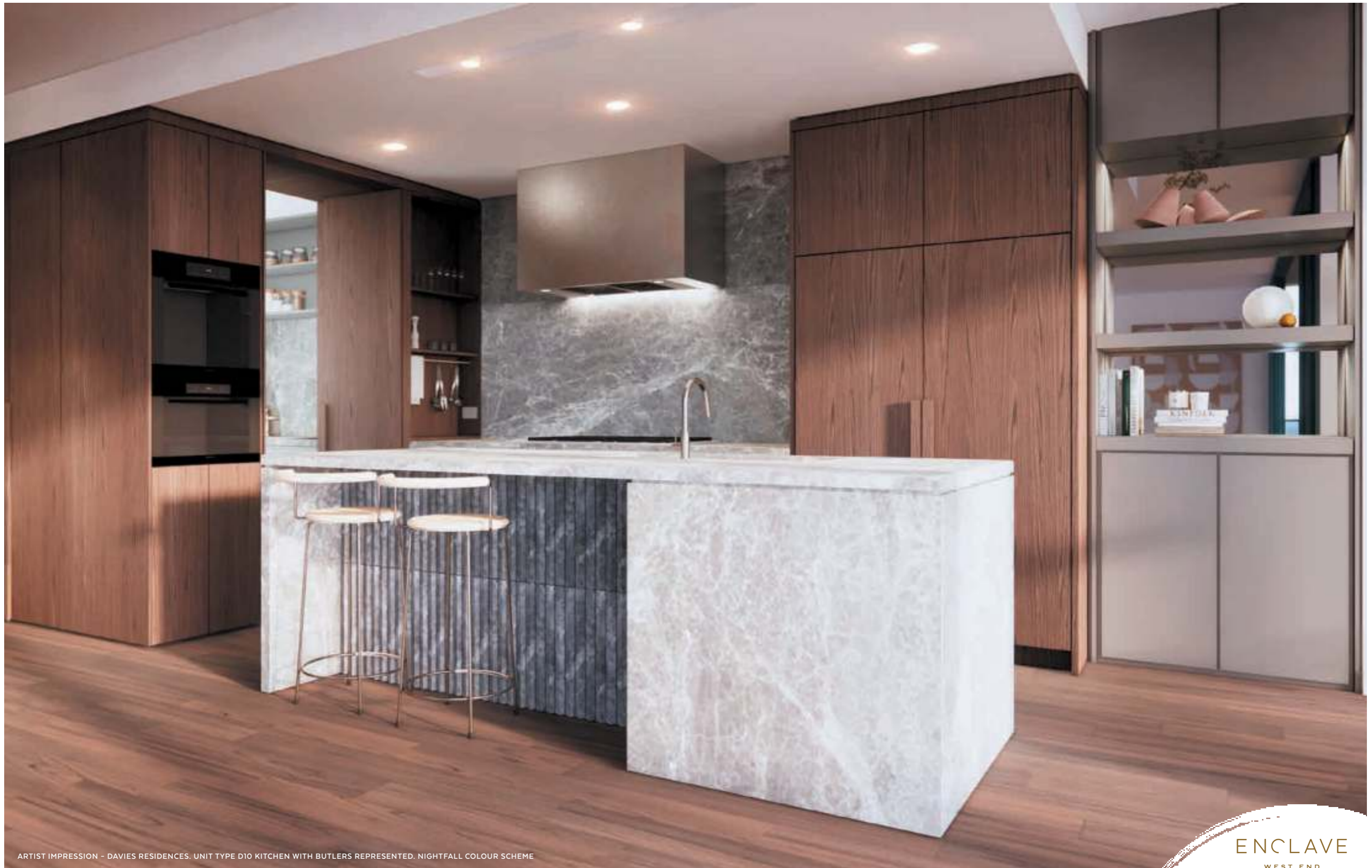
ARTIST IMPRESSION - DAVIES RESIDENCES. UNIT TYPE D10 KITCHEN WITH BUTLERS REPRESENTED. NIGHTFALL COLOUR SCHEME