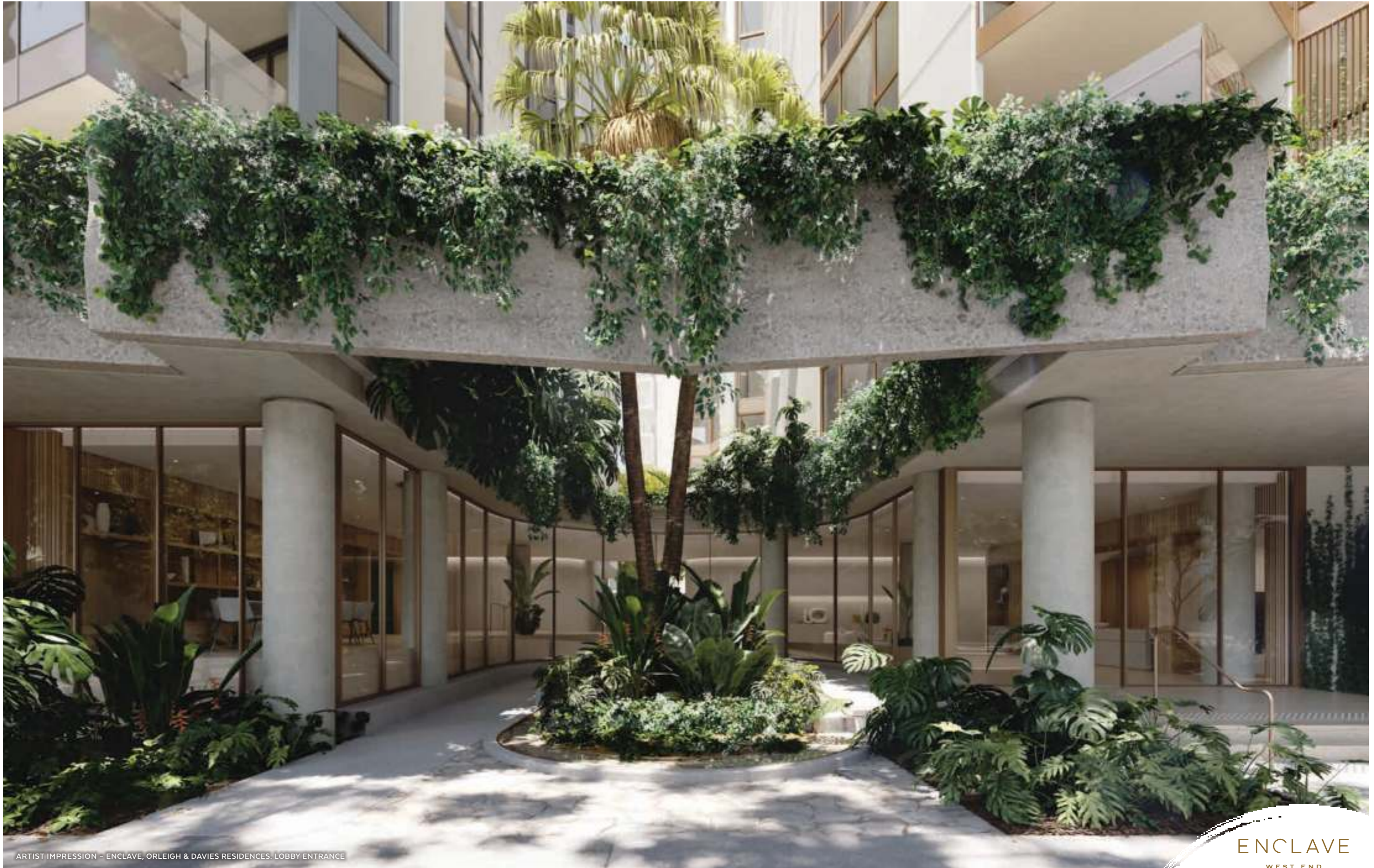
ARTIST IMPRESSION - ENCLAVE, ORLEIGH & DAVIES RESIDENCES. LOBBY ENTRANCE