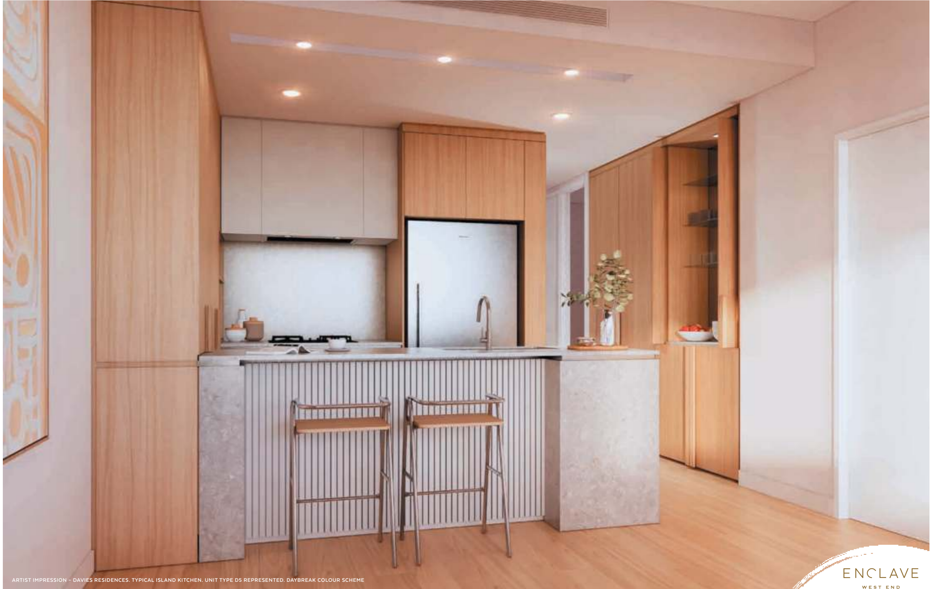
ARTIST IMPRESSION - DAVIES RESIDENCES. TYPICAL ISLAND KITCHEN. UNIT TYPE D5 REPRESENTED. DAYBREAK COLOUR SCHEME