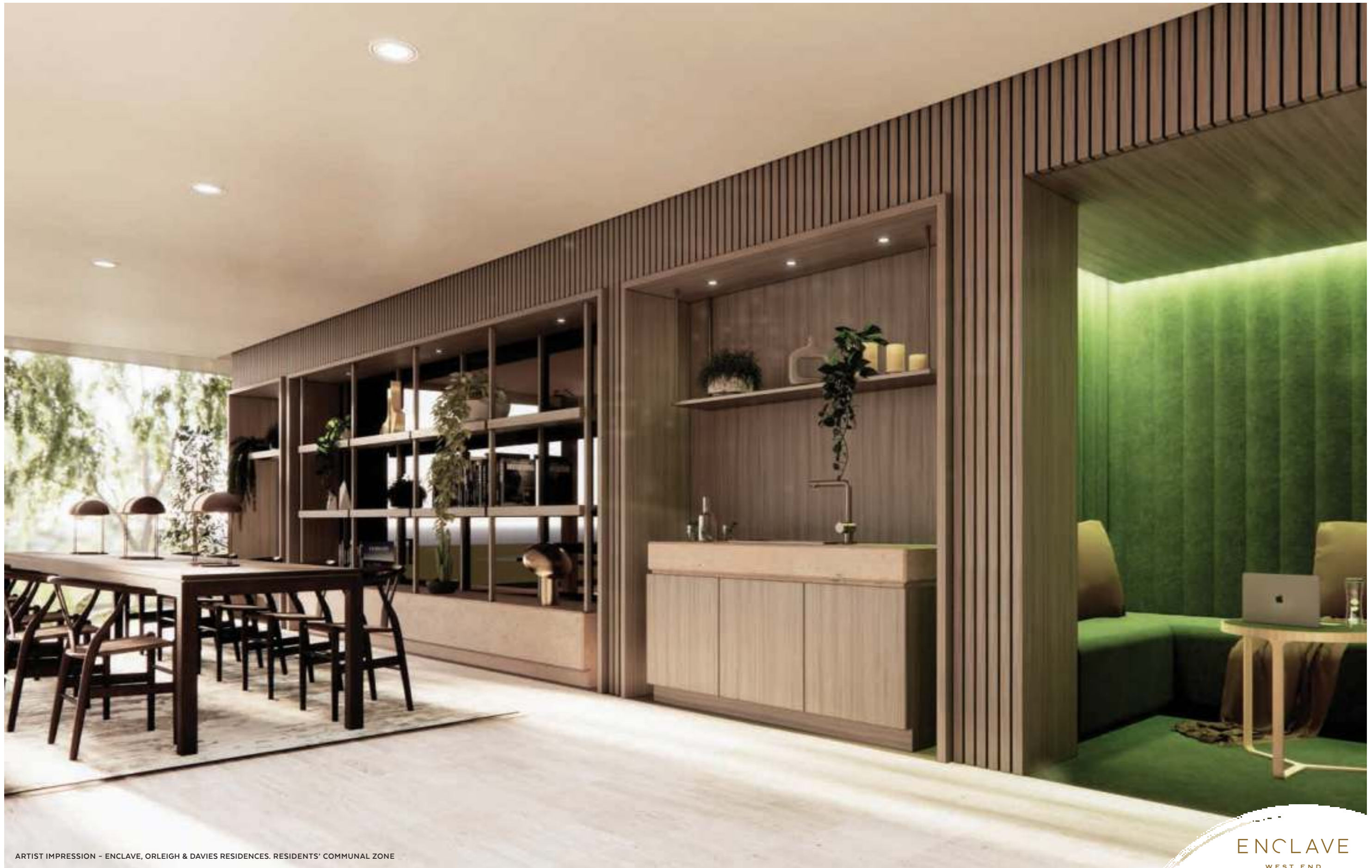
ARTIST IMPRESSION - ENCLAVE, ORLEIGH & DAVIES RESIDENCES. RESIDENTS' COMMUNAL ZONE