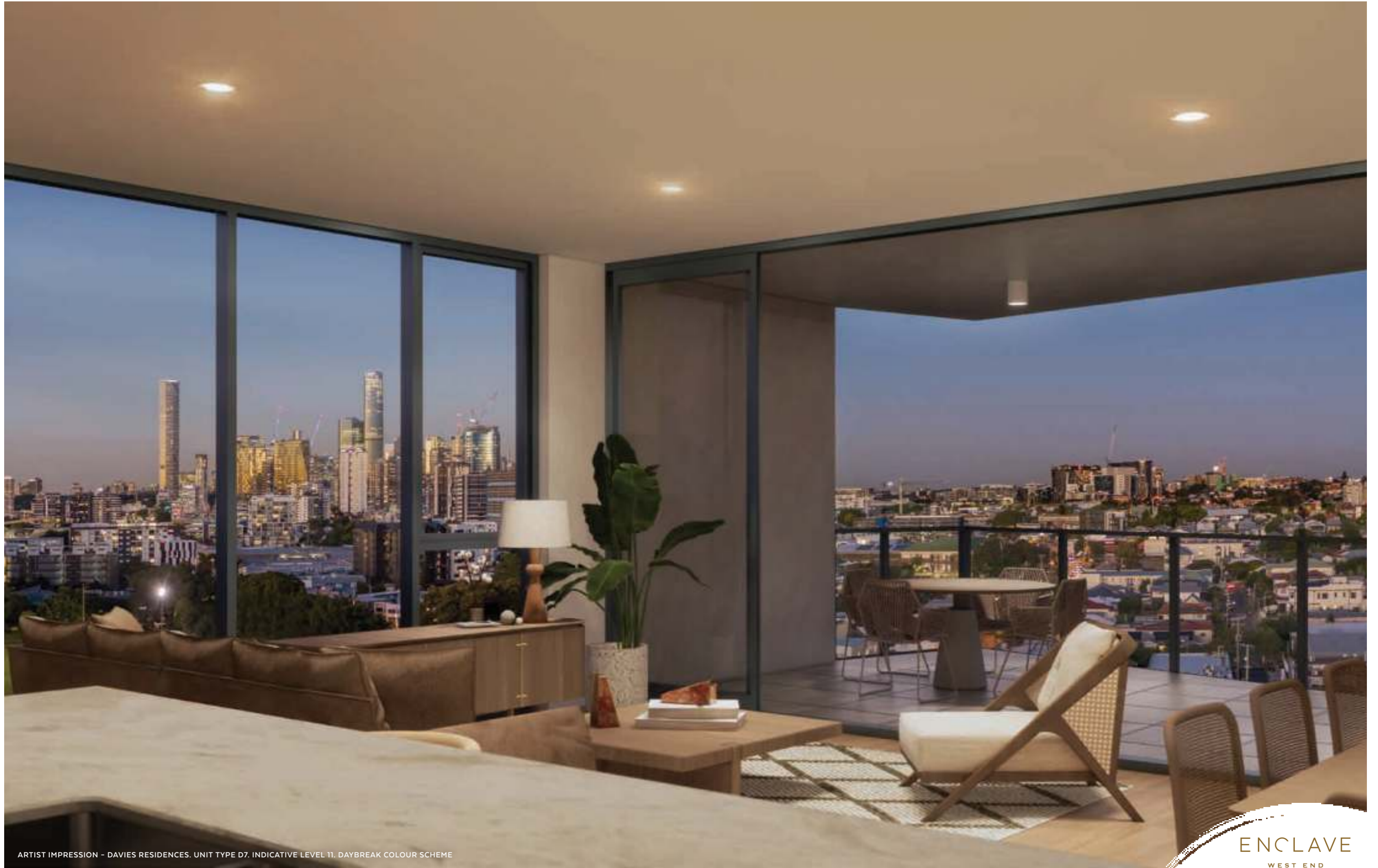
ARTIST IMPRESSION - DAVIES RESIDENCES. UNIT TYPE D7. INDICATIVE LEVEL 11. DAYBREAK COLOUR SCHEME