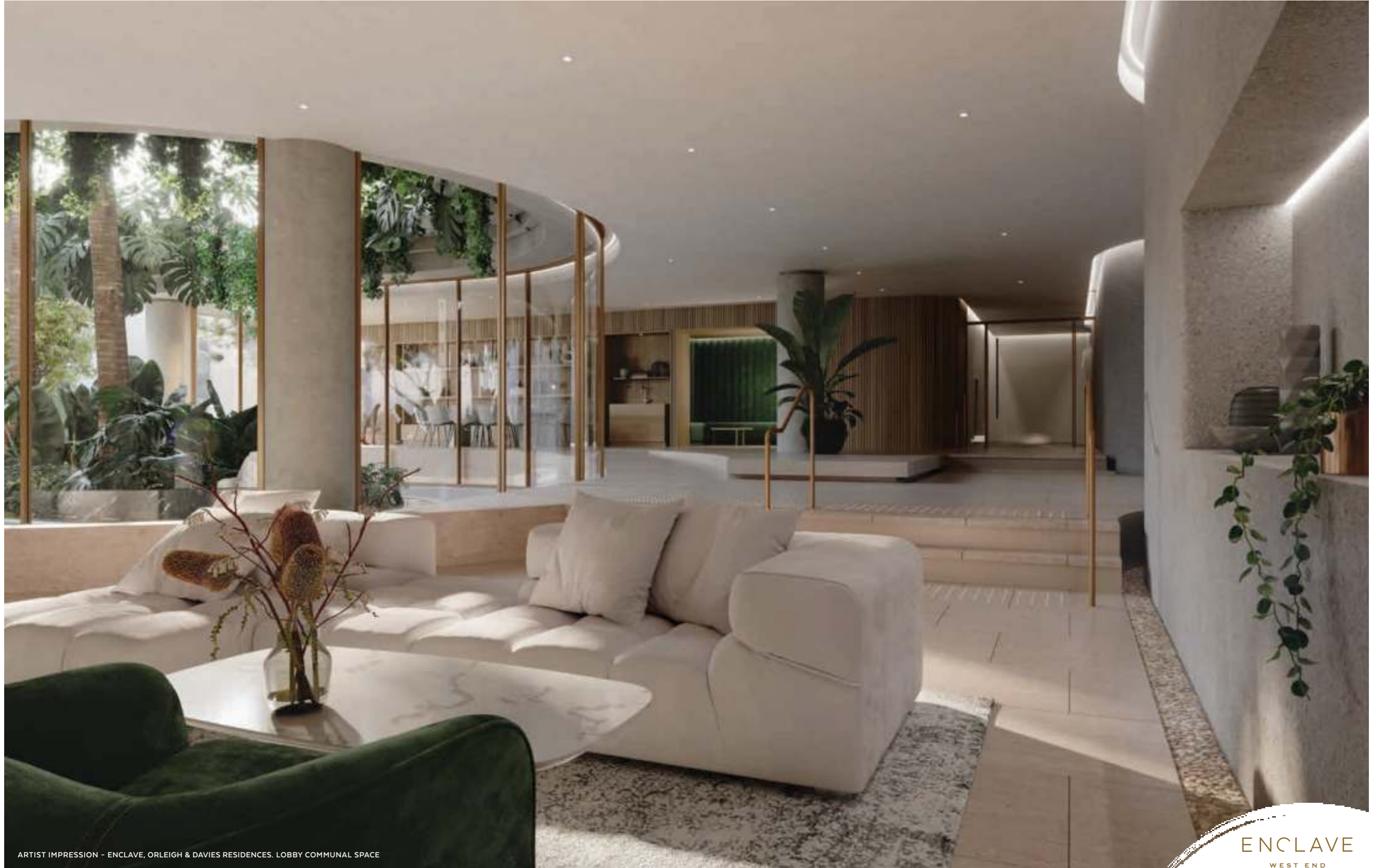
ARTIST IMPRESSION - ENCLAVE, ORLEIGH & DAVIES RESIDENCES. LOBBY COMMUNAL SPACE