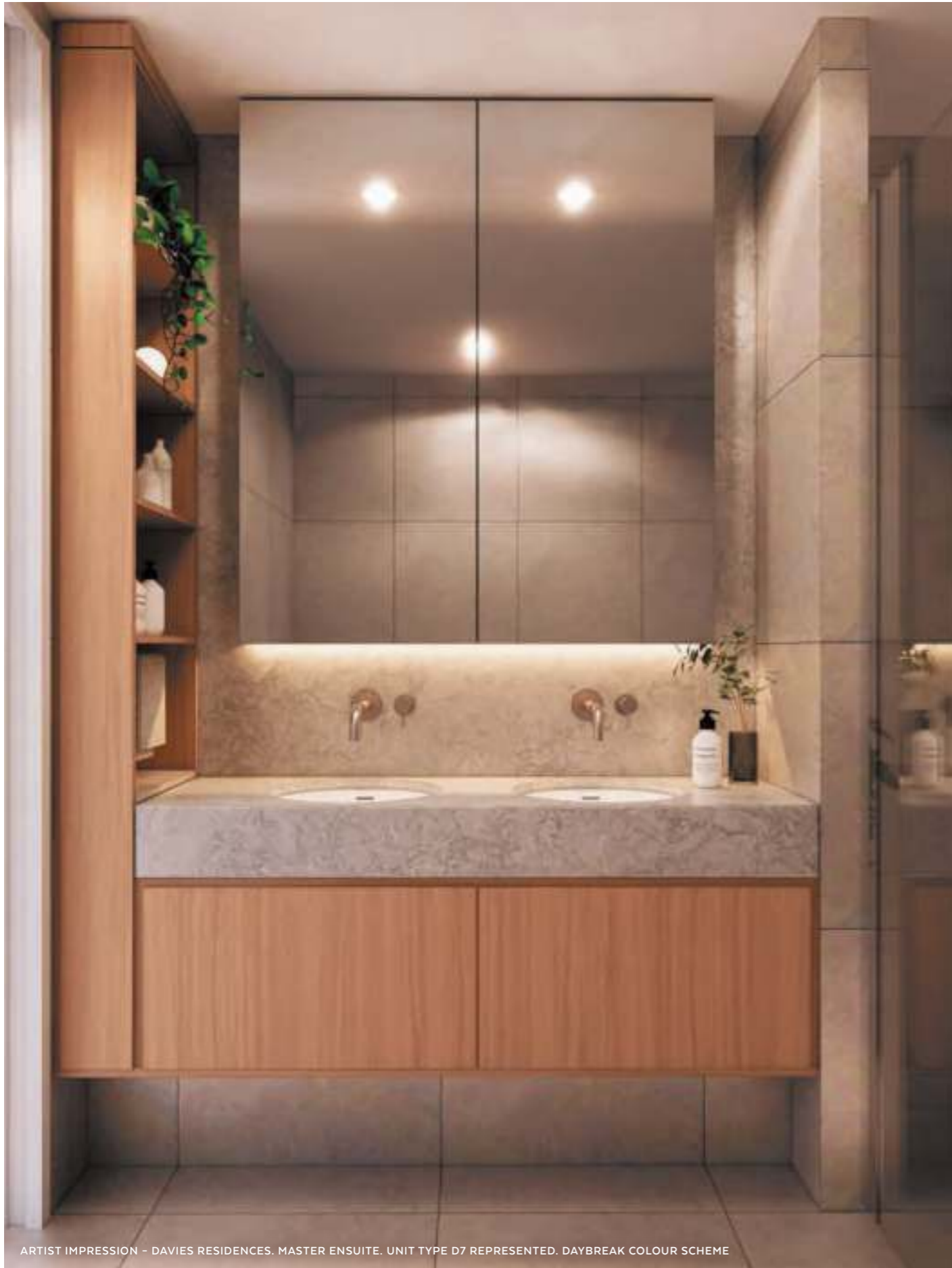
ARTIST IMPRESSION - DAVIES RESIDENCES. MASTER ENSUITE. UNIT TYPE D7 REPRESENTED. DAYBREAK COLOUR SCHEME