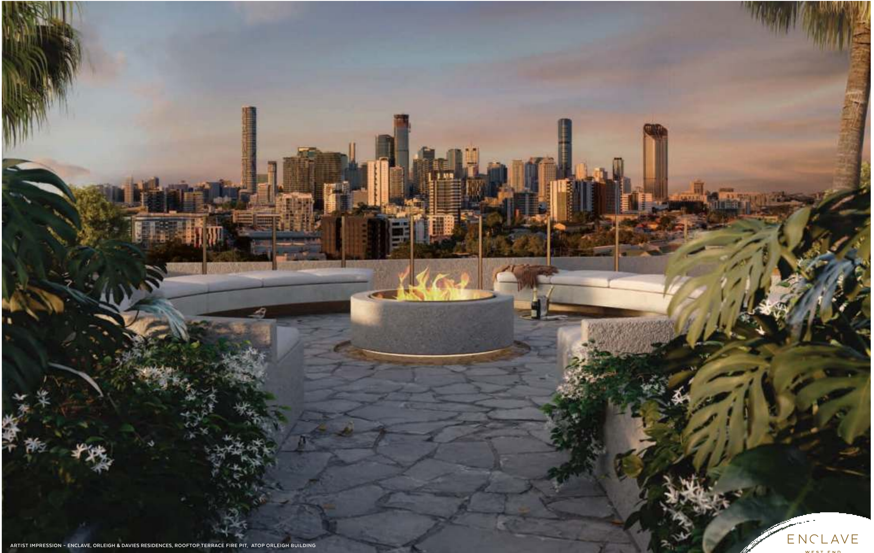
ARTIST IMPRESSION - ENCLAVE, ORLEIGH & DAVIES RESIDENCES, ROOFTOP TERRACE FIRE PIT, ATOP ORLEIGH BUILDING